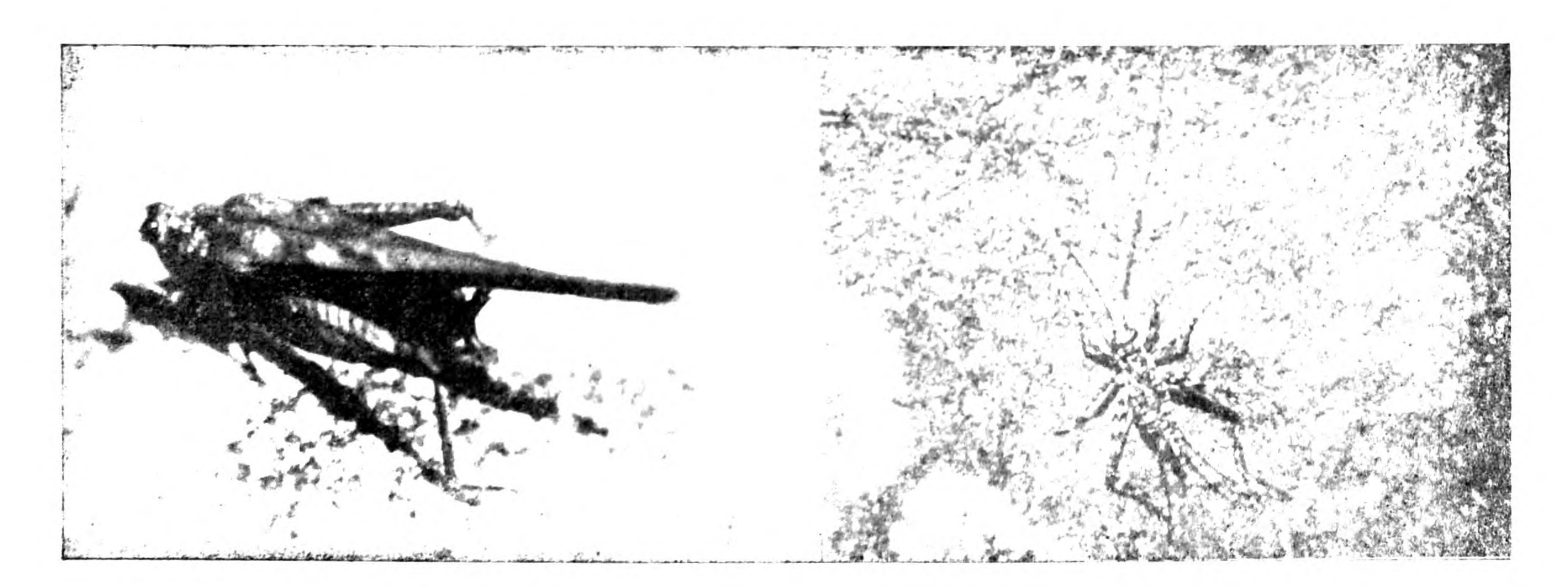
Fig. 6. Euscelimena gavialis (Sauss.) Q.

Widely distributed in Ceylon. Chopard (1936) reports on very scarcely occurring macropterous specimens, which were found with the typical wing-less form.